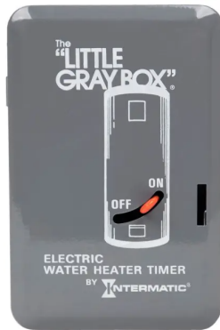
Little Gray Box Closed