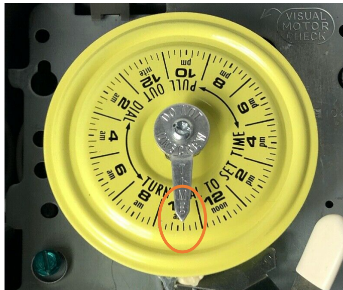
This clock shows the current time is 10:15am

VIDEO ASSISTANCE: Here is a video that will help you with adjusting the time and how to set the 'trippers'/pins on the clock to automatically turn on and off the heater. https://youtu.be/KYlifc8Rmh8