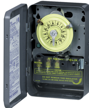
Little Gray Box Open